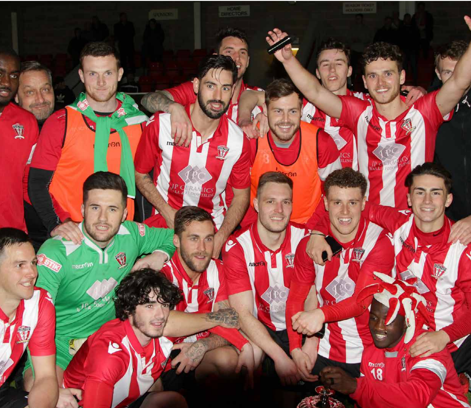
WITTON ALBION CELEBRATE WINNING THE MID-CESHIRE DISTRICT FA SENIOR CUP 2017/18